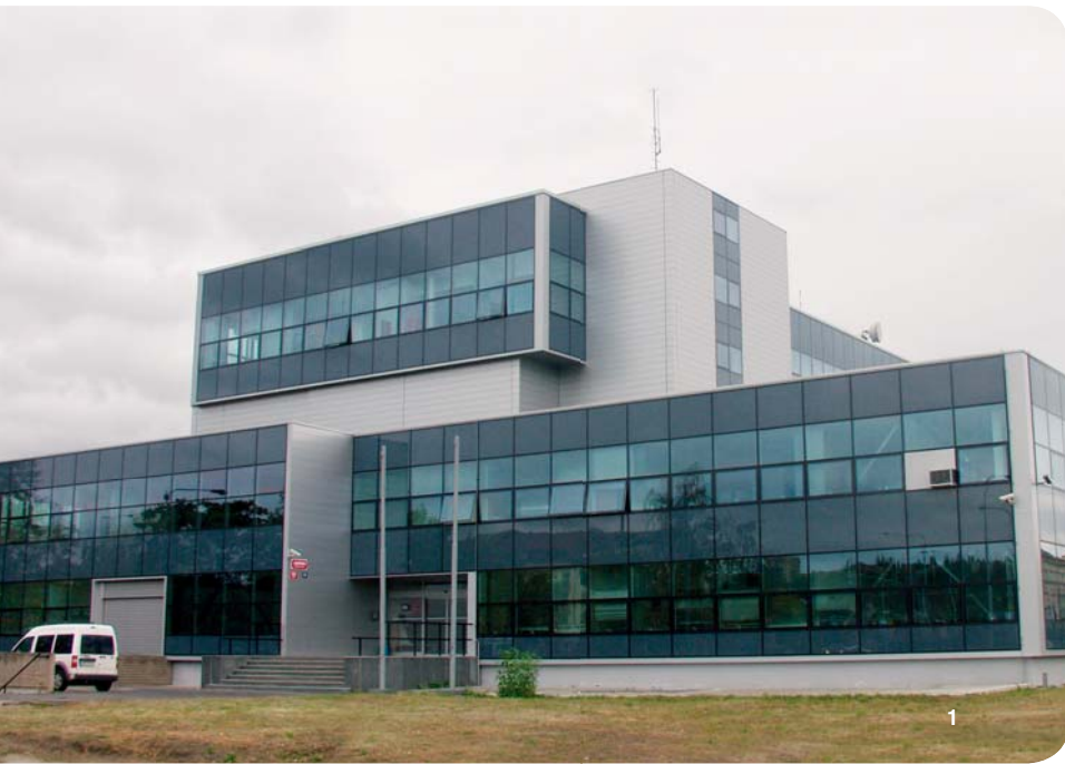
1 Building of the Technical and Documentary Museum of Prague power supply.